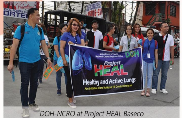
DOH-NCRO at Project HEAL Baseco