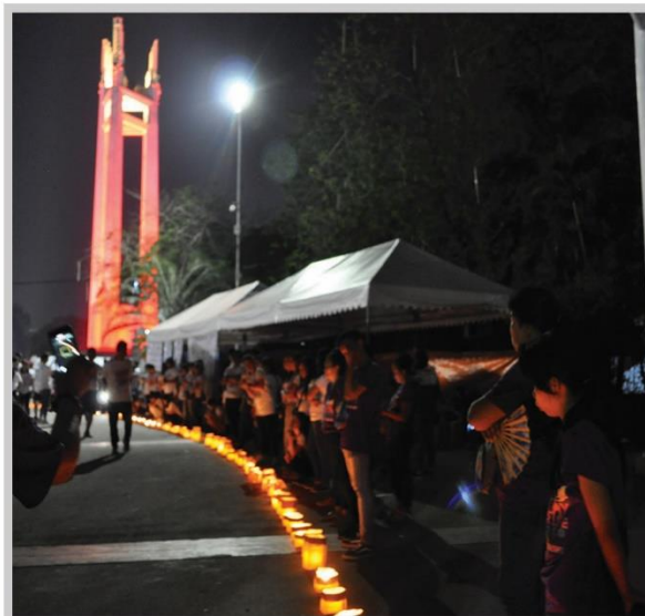
Luminaria; Candle-lighting during the Relay for Life 2018

Upon joining the event, t-shirts were given to those who registered and participated. The people who joined were all actively participating in the walk around the vicinity as they held their own organization flags or tarpaulins. This continued until the end of the event. When 12 o'clock am hits, the 'Luminaria' program was initiated.