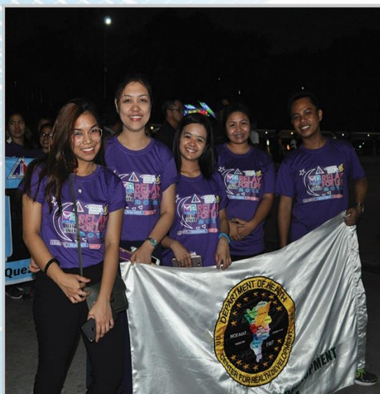
DOH-NCRO at Relay for Life 2018

The fundraising event of Philippine Relay for Life 2018 was organized by the Philippine Cancer Society as all the funds that were collected were also given to the patients currently fighting against cancer. The goal of the Relay for Life is to raise awareness against the plight of people with cancer, provide assistance to them and to give them hope that people are always there to support and care. The event started at 4 o'clock in the afternoon on March 16 and ended at 7 o'clock in the morning on March 17.